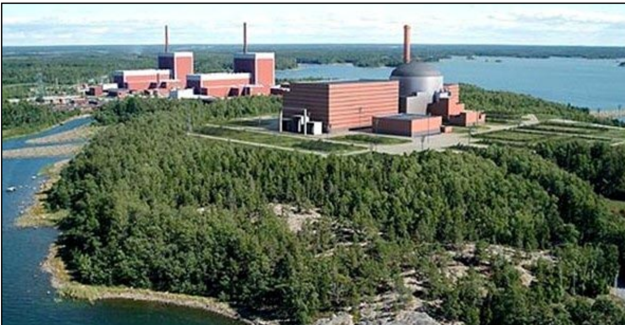
Finland's Olkiluoto nuclear power plant.