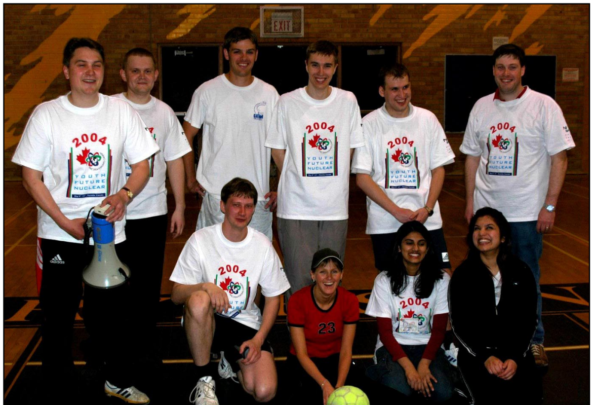
Right: IYNC attendees take a break from the fun and games to pose for a photo op.