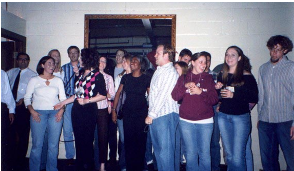
U.S. participants perform their national anthem, "The Star-Spangled Banner."