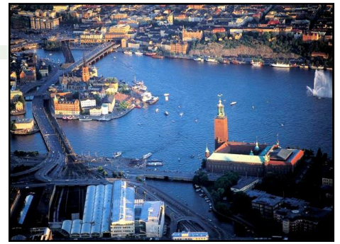
Stockholm from the air.

Finland where there will be an extensive technical visit including the construction of the world's first EPR, geological repository, NPP, etc.