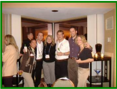
NA-YGN members enjoying the Ureco sponsored social!

Over forty NA-YGN professionals and friends joined in Albuquerque, New Mexico for our NA-YGN social sponsored by Ureco. With their generous support, NA-YGN was able to host an excellent social event that had the greatest view of the city – nineteen stories high from the Hyatt Hotel. The night view was amazing and breathtaking. New friends and old friends were able to reminisce and share their stories. Thanks everyone who came by and we hope to see you again at the 2007 ANS Young Professionals Congress – a joint event with ANS Young Member's Group and NA-YGN. Hope to see you in Washington D.C!